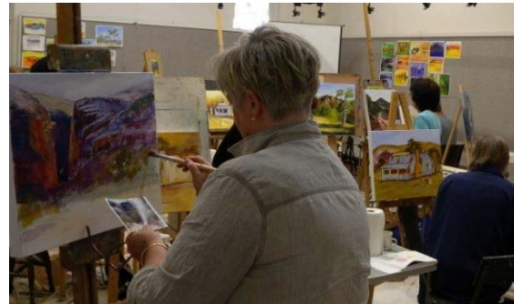
Figure 2 Boot Camp Attendees in action

The Tutor, Richard Rogers , is known for vibrant paintings of Australia's landscape, wildlife and people. A regular contributor to the Australian Artist magazine, his work has also featured in The Artists Palette & International Artist magazines. www.richardrogers.com.au