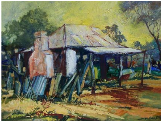
Figure 1 Settlers Cottage Blinman

You will be provided with Atelier Interactive Acrylic paints, references, canvas sheets & stretched canvas.