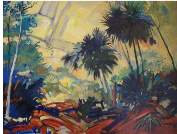
Figure 2 Palm Valley in Northern Territory