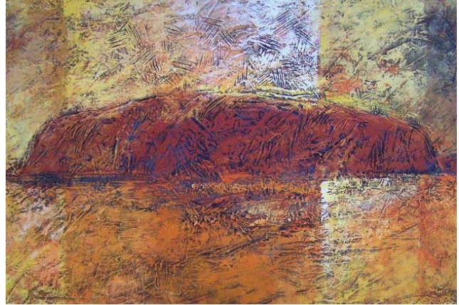
Figure 2 Uluru, Northern Territory